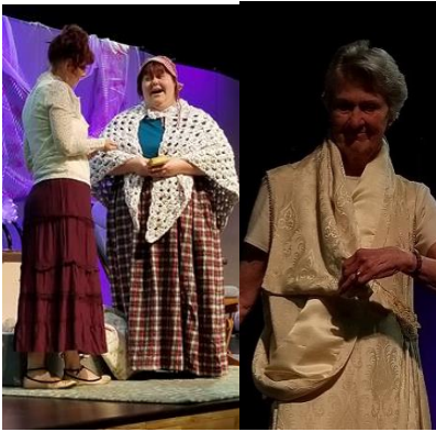
4 th Annual Fashion Show & Afternoon Tea